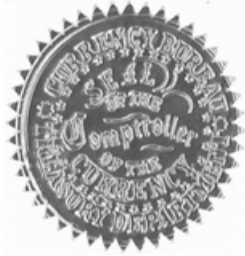
Comptroller of the Currency

IN TESTIMONY WHEREOF, today, October 28, 2016, I have hereunto subscribed my name and caused my seal of office to be affixed to these presents at the U.S. Department of the Treasury, in the City of Washington, District of Columbia.